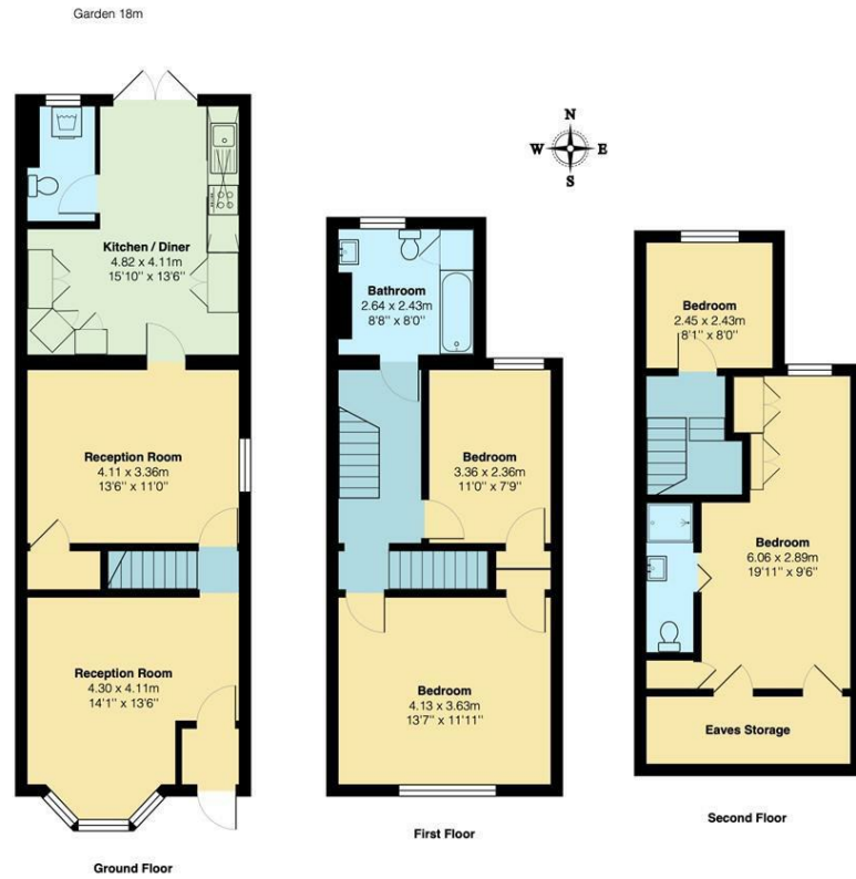
Total Area: 126.1 m 2 ... 1357 ft 2 (excluding eaves storage) All measurements are approximate and for display purposes only.